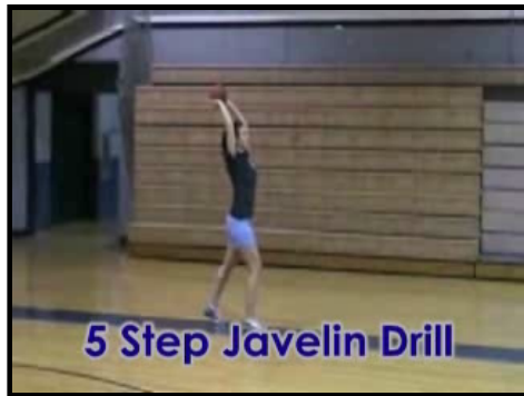
5 Step Javelin Drill